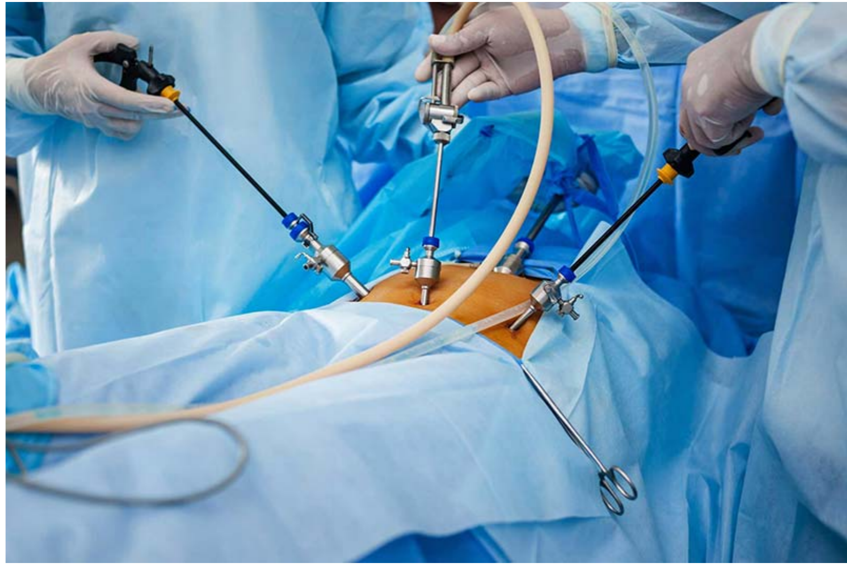
Advanced Laparoscopic Surgery